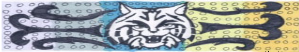
DRAWN BY: Meraal Hasan